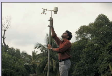
Installation of the Ambient weather station

Foundation for Environment, Climate and Technology [FECT] Sponsors: US National Academy of Sciences, USAID