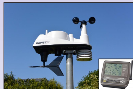
Davis Vantage Vue Weather Station