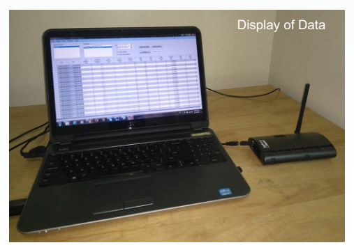
Live Data : The internet based software included in the equipment features the main models. It is accessible from the computer. Below we show the figures from the interface.